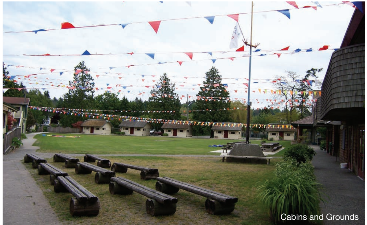
Cabins and Grounds

Combination of Longhouse and Standard facilities